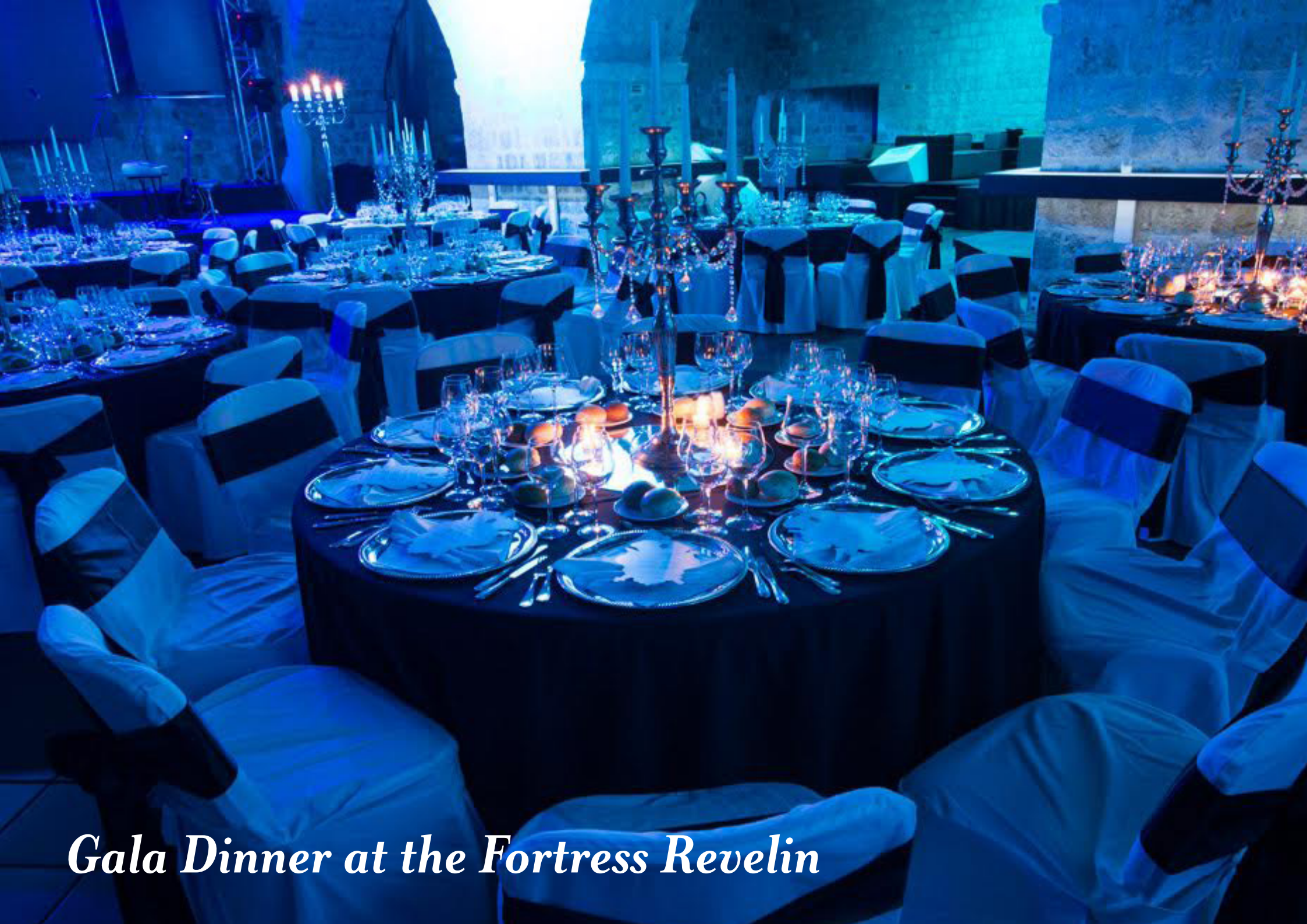
Gala Dinner at the Fortress Revelin