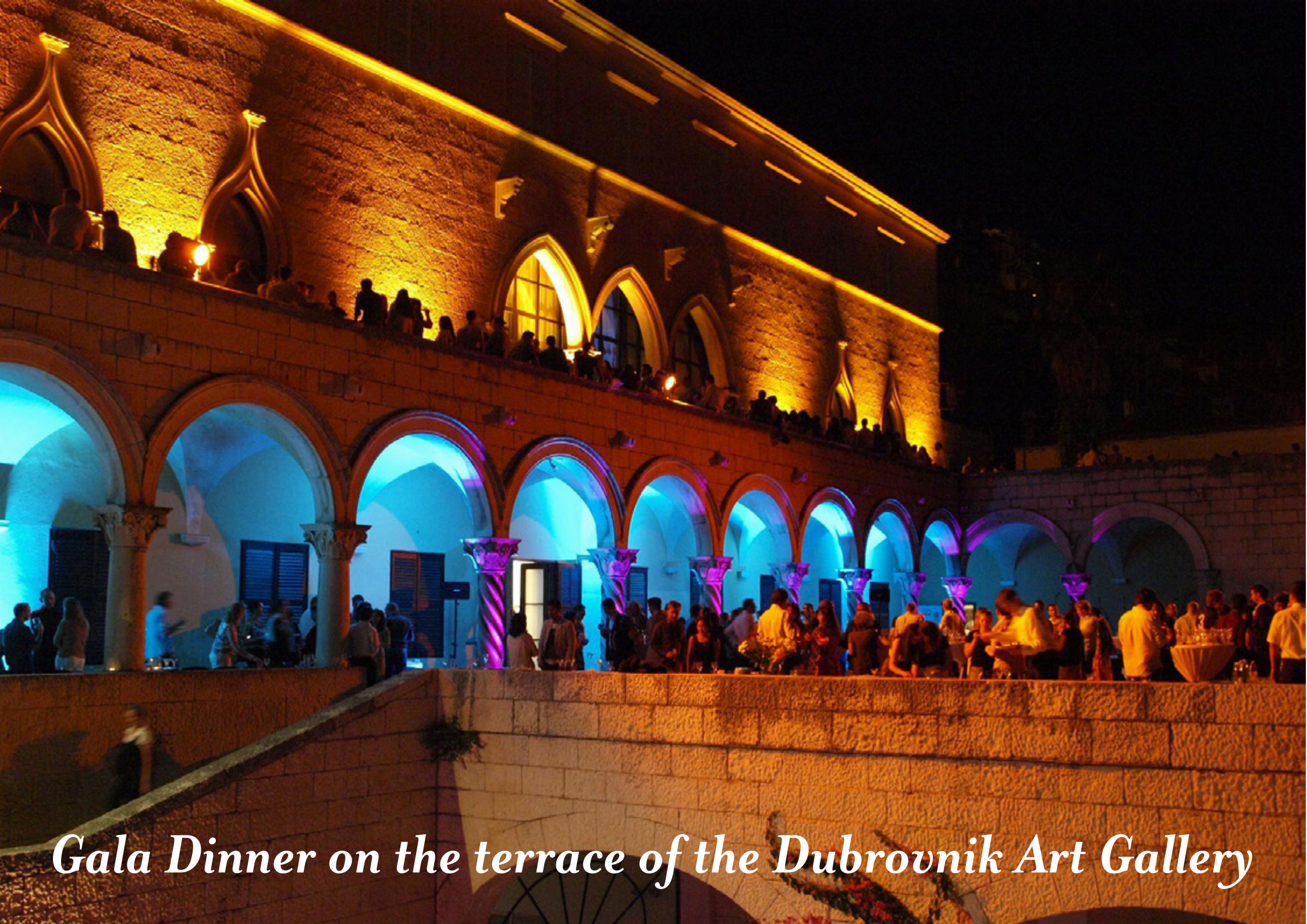
Gala Dinner on the terrace of the Dubrovnik Art Gallery