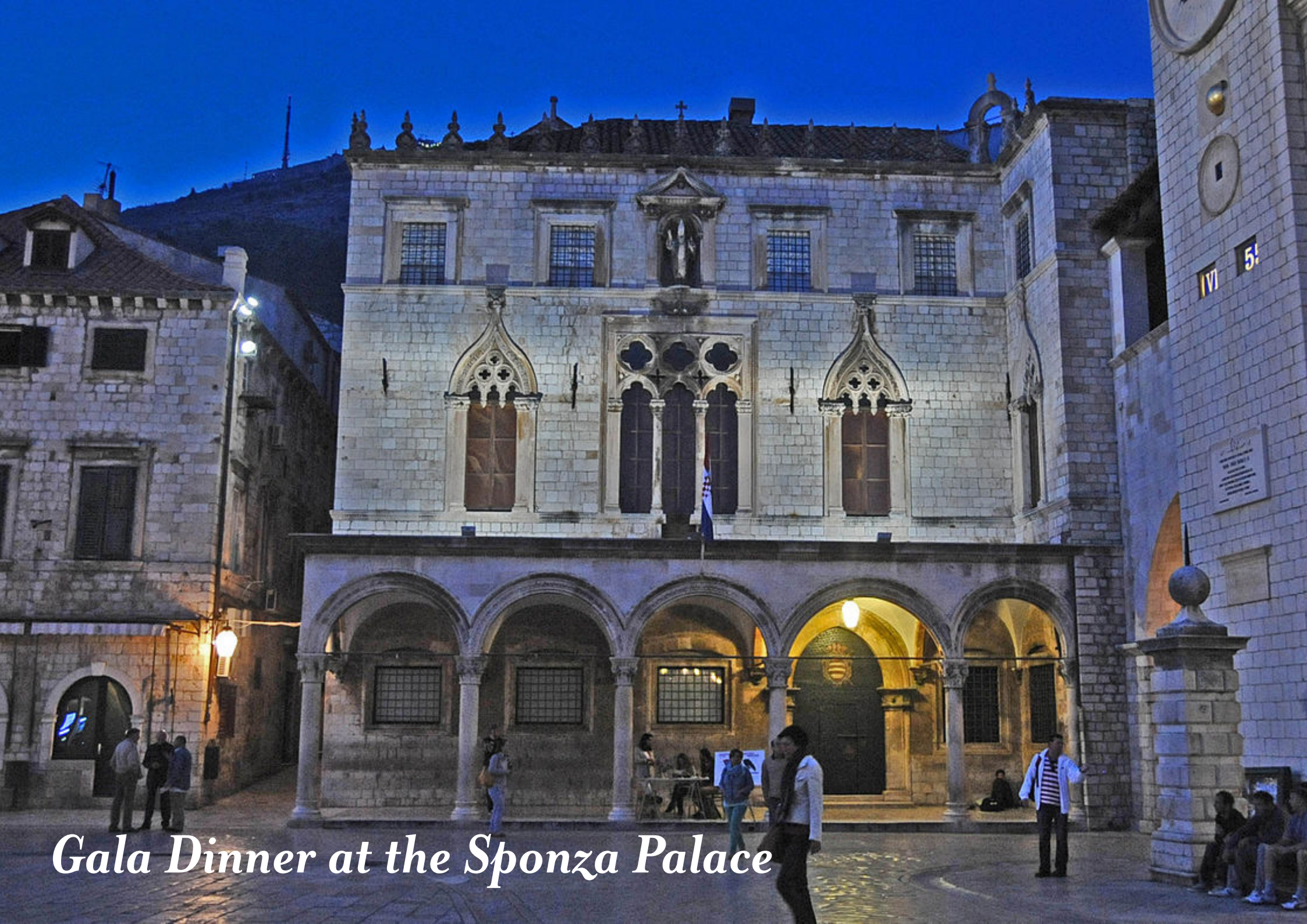
Gala Dinner at the Sponza Palace